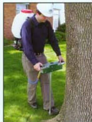
HTI 2000 Soil Injector

Grid pattern – Holes are spaced on 2.5 foot centers in a grid pattern extending to the drip line of the tree. Larger trees require more holes. The drawback of the grid methods is material placed in between roots may not be taken up, which can compromise overall performance.